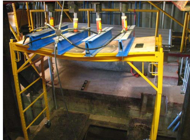
Failure at 6,025 lbs

Our letters and reports are for the exclusive use of the client to whom they are addressed and shall not be reproduced except in full without the approval of the testing laboratory. The use of our name must receive our written approval. Our letters and reports apply only to the sample tested and/or inspected, and are not indicative of the quantities of apparently identical or similar products. Unless otherwise noted all test methods and specifications are to the most current revision. Material submitted to our metals department will be discarded after a period of 30 days unless otherwise directed.