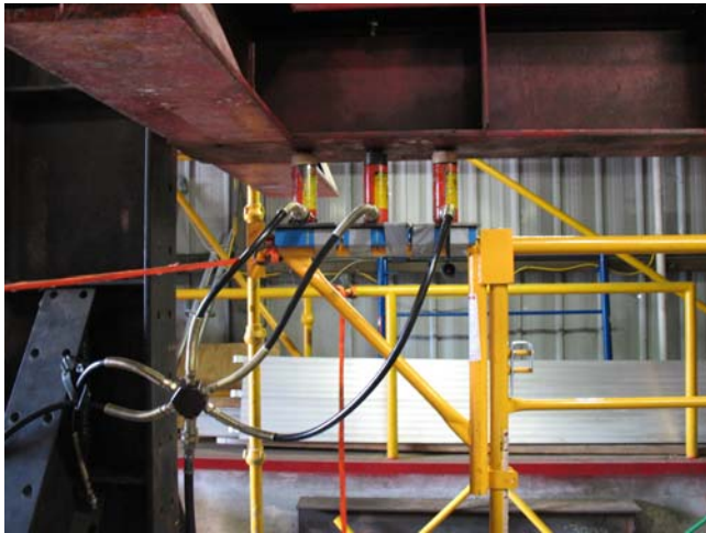
Clip-On Bracket Pre-Load