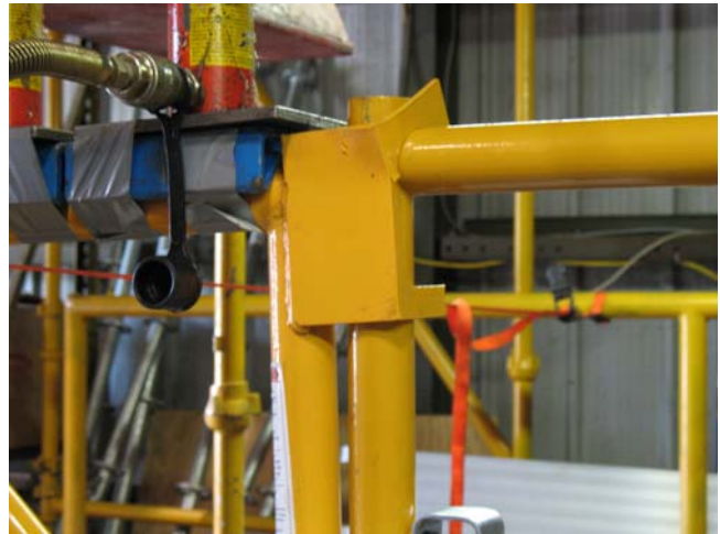
Clip-On Bracket Deflection at 2,795 lbs.

Our letters and reports are for the exclusive use of the client to whom they are addressed and shall not be reproduced except in full without the approval of the testing laboratory. The use of our name must receive our written approval. Our letters and reports apply only to the sample tested and/or inspected, and are not indicative of the quantities of apparently identical or similar products. Material submitted to our metals department will be discarded after a period of 30 days unless otherwise directed.